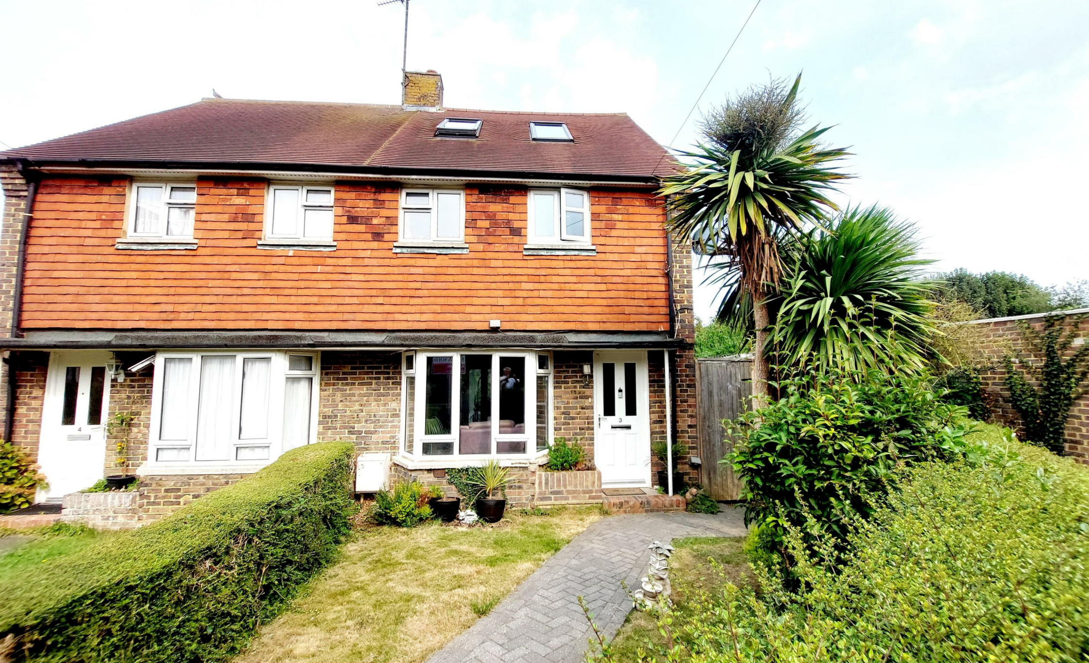
3 The Laines The Furlongs, Alfriston, BN26 5XS